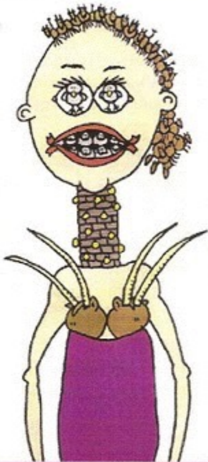
The "bride" (a literalist's interpretation) as described in Songs 4.

Beautiful you are, my darling, Beautiful you are!